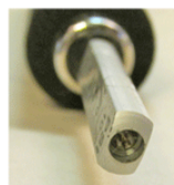
Air Gauge $35.00 MAG9S

For use on motorcycle/valve stems that come straight from the center of the wheel rim or at a 45° angle or are directly facing you. All metal gauge 0-160psi in 2lb increments. External screw adjustment for re-calibration. Protective foam grip for better handling and added protection.